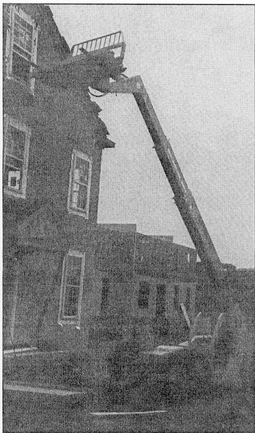
A Pettibone Lift 8044 raises roof joists on the Lantern Hill site.

This neo-traditional development has gone through a complex process to get to the building stage, and has challenges yet to come. One of the first obstacles faced by Granor Price and its engineers was the location of the Texas Eastern pipeline, which traverses the site. This WWII-era pipeline was originally built to transport petroleum from Texas oil fields to eastern ports to avoid shipping the oil through submarine-infested waters in the Gulf of Mexico.