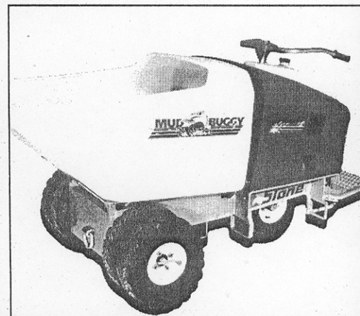
Stone Mud Buggy™ SB1600.